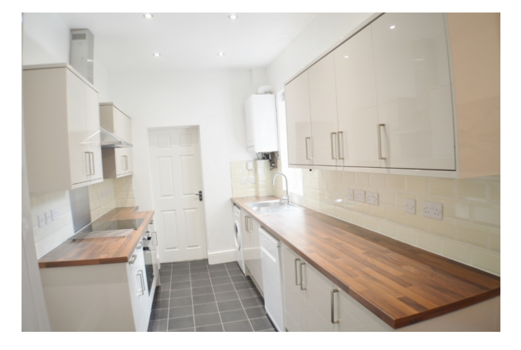
£130 Per Person Per Week

Shelton Street, City Centre, Nottingham, NG3 1DP